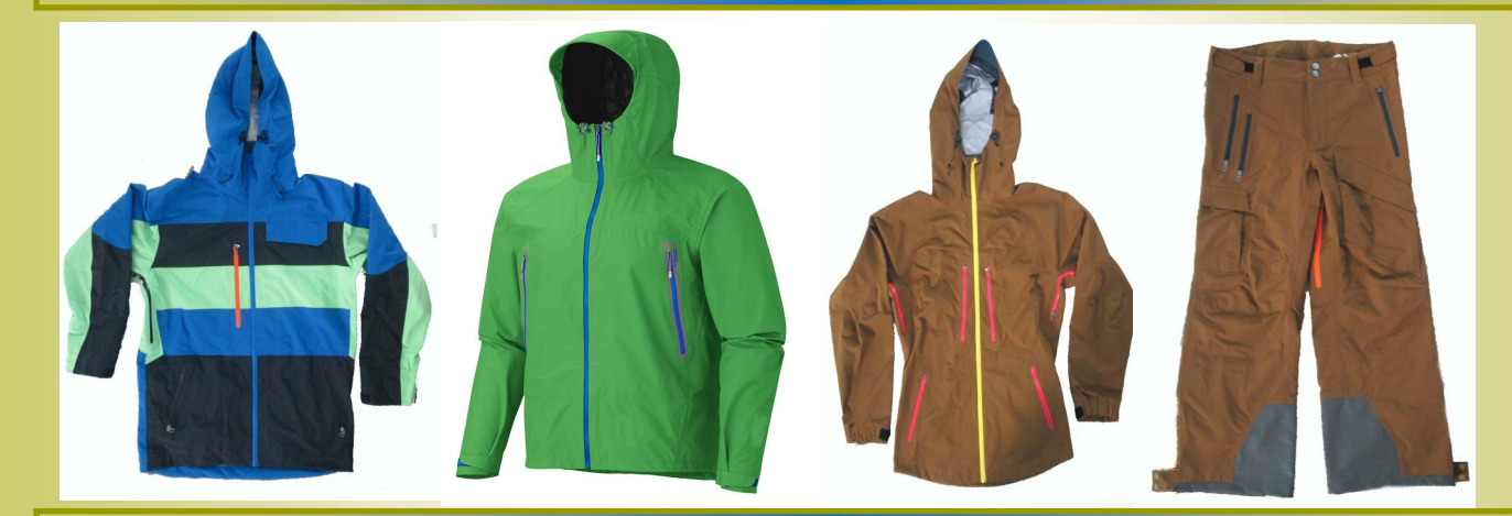
Motor bike wear